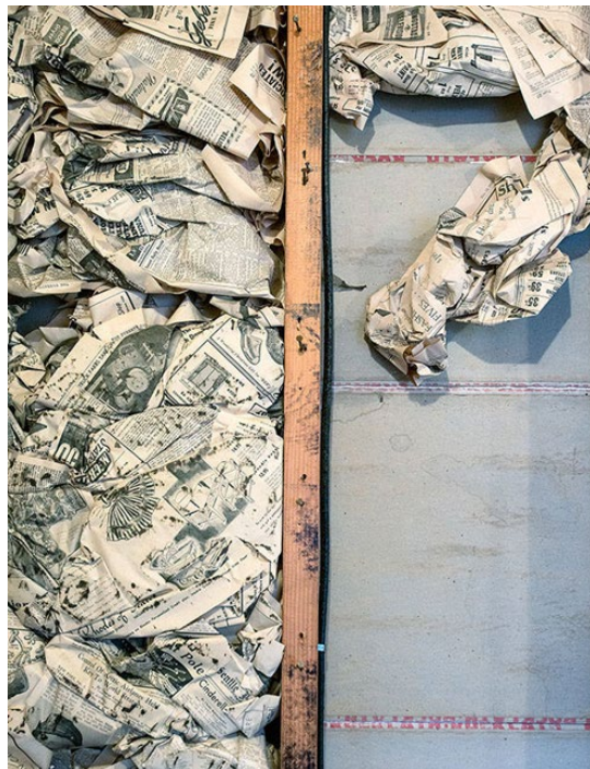
Newspaper used for insulation in the walls of an old house

Beyond the more practical uses, newspaper can also be used for fun. Make a hat to play different characters or make a couple of boats to race down a stream!