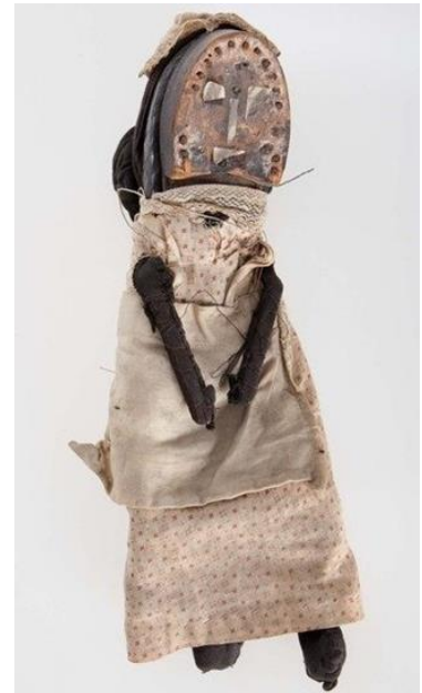
Doll made from cloth and the sole of a shoe