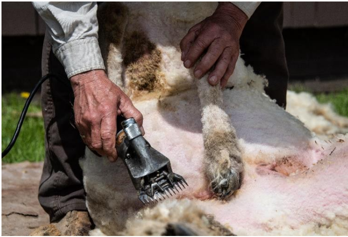
A shearer uses electric clippers to shear a sheep.

Modern shearers use electric clippers. These clippers have a comb on the bottom which goes into the wool first. The comb lines the wool up to be cut. The comb can have two shapes: straight or flared. The straight comb is easier to use. The flared comb has teeth on each side that flare out from the comb. These flared combs allow the shearer to gather a little more wool with each pass. The cutter sits just above the comb and is the part of the clipper that moves back and forth. To keep the clippers from overheating, shearers use an oil to lubricate the moving pieces.