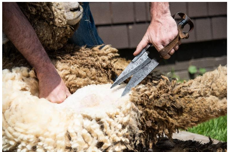
A shearer uses blade shears to shear a sheep.

Blade shears are another tool used for shearing. These look similar to scissors except the hinge is farthest from the blades instead of in the middle. Blade shears do not use electricity and leave more wool on the sheep than clippers. This makes them ideal for colder climate areas where sheep need to maintain some wool to be comfortable. Blade shears are not used as often today as electric clippers.