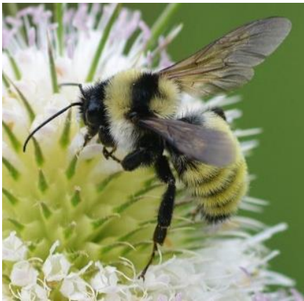
The Golden Northern Bumble Bee is the classic bee most of us picture.

What color is a bee? There are many answers to this question, because there are many types of bees! The most common ones are usually yellow and black, often with stripes. But bees come in a rainbow of colors! Here are just a few of them: