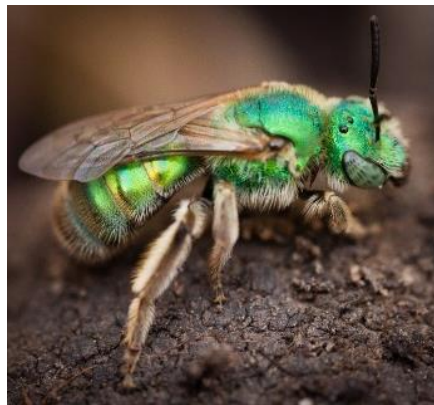
Sweat Bees don't have stingers and can't hurt you, but they do like your sweat!