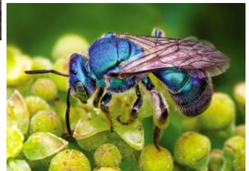
Blue Orchard Mason Bees construct their nests from mud and other materials.