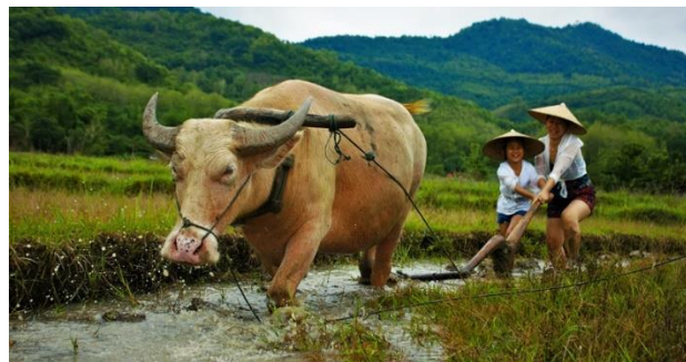
A draft Water Buffalo working in a rice field

In other parts of the world, water buffalo are used as draft animals. In fact, over 160 million water buffalo are used around the world as working animals. Many work in Asian countries where they help in the production of rice.