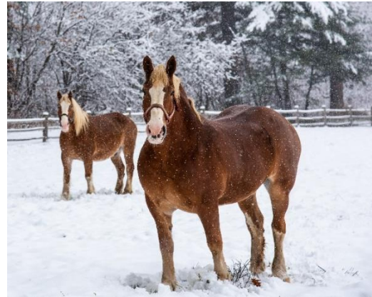
Max and Banner, Billings Farm's team of Belgian draft horses.

Horses are another very common type draft animal. Horses are faster than oxen and were often used for transportation like pulling wagons and carts. They're also well suited to being used for plowing and other field work with equipment you can ride on. When a teamster is driving a pair of draft horses, they are usually sitting behind them on the equipment and using reins to control where they go.