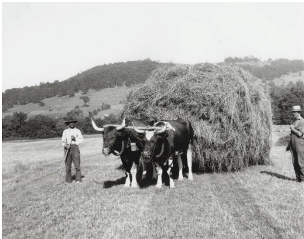
Oxen pulling a hay cart at Billings Farm

A draft animal is an animal that has been trained to do work – specifically to pull heavy loads. The two most common draft animals are horses and oxen or working steers. On farms, draft animals can be used to plow fields, pull wagons, stone boats, and logs. Farmers have also used them to pull sleds with huge barrels of maple sap for sugaring season in the Northeast. Today, farms rely on tractors to do the work historically done by draft animals. However, there are still teamsters (people who train and drive draft animals) who work with draft animals on their