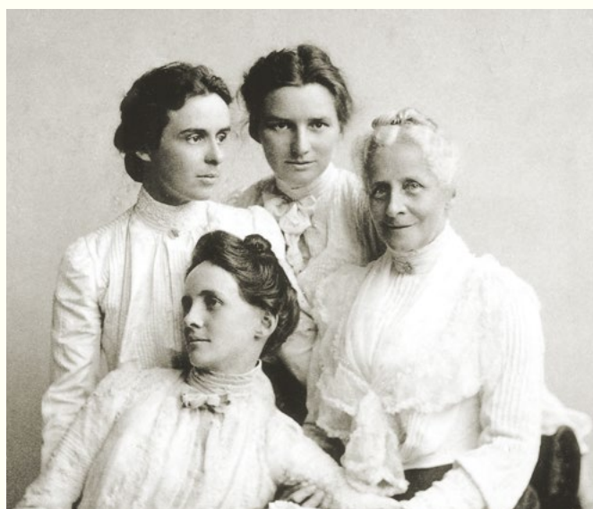
TOP: The Billings Backyard Series launched with topics such as Composting at Home. LEFT: New food programming showcased recipes using Billings Farm cheeses, including fondue. ABOVE: The Women of Billings Farm was introduced as an interpretive presentation in 2020.