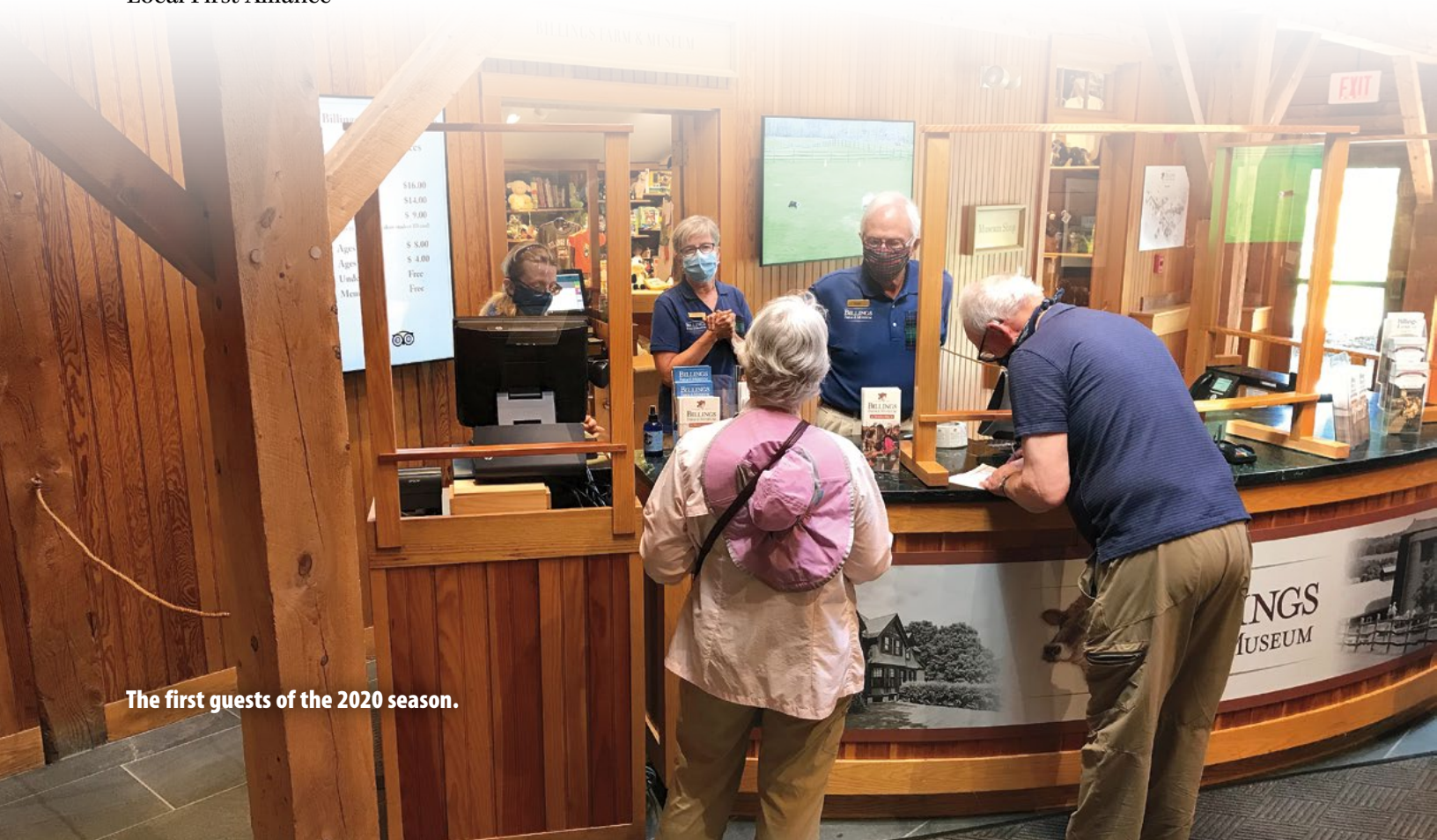
The first guests of the 2020 season.

Woodstock Union Middle and High School Resilience Academy