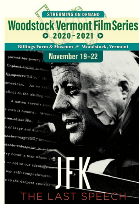
ABOVE: The Woodstock Vermont Film Series went virtual with 15 streaming films.

While the Woodstock Vermont Film Series postponed three films in the spring of 2020, the option to convert to an online series in the fall came to fruition with support from the film series' many sponsors. The postponed films returned in streaming form, and a full season was developed and presented to the filmgoing audience with the use of an online viewing platform.