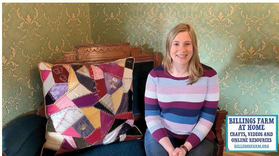
BILLINGS FARM AT HOME CRAFTS, VIDEOS AND ONLINE RESOURCES BILLINGSFARM.ORG