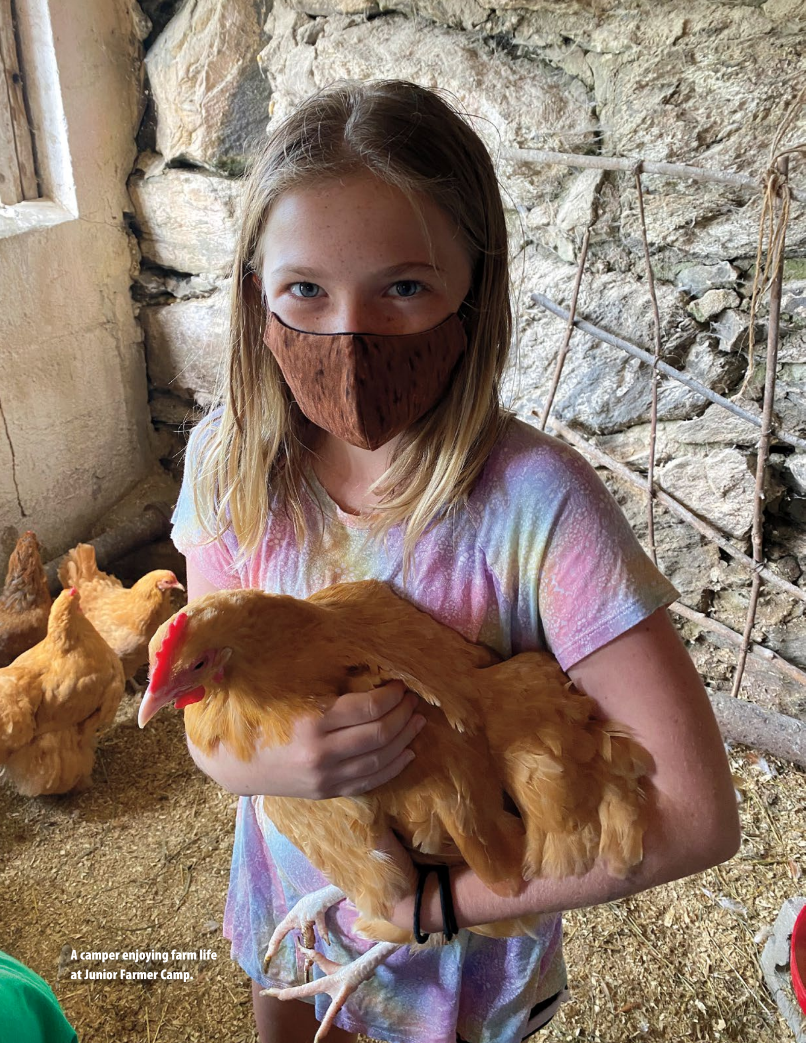
A camper enjoying farm life at Junior Farmer Camp.