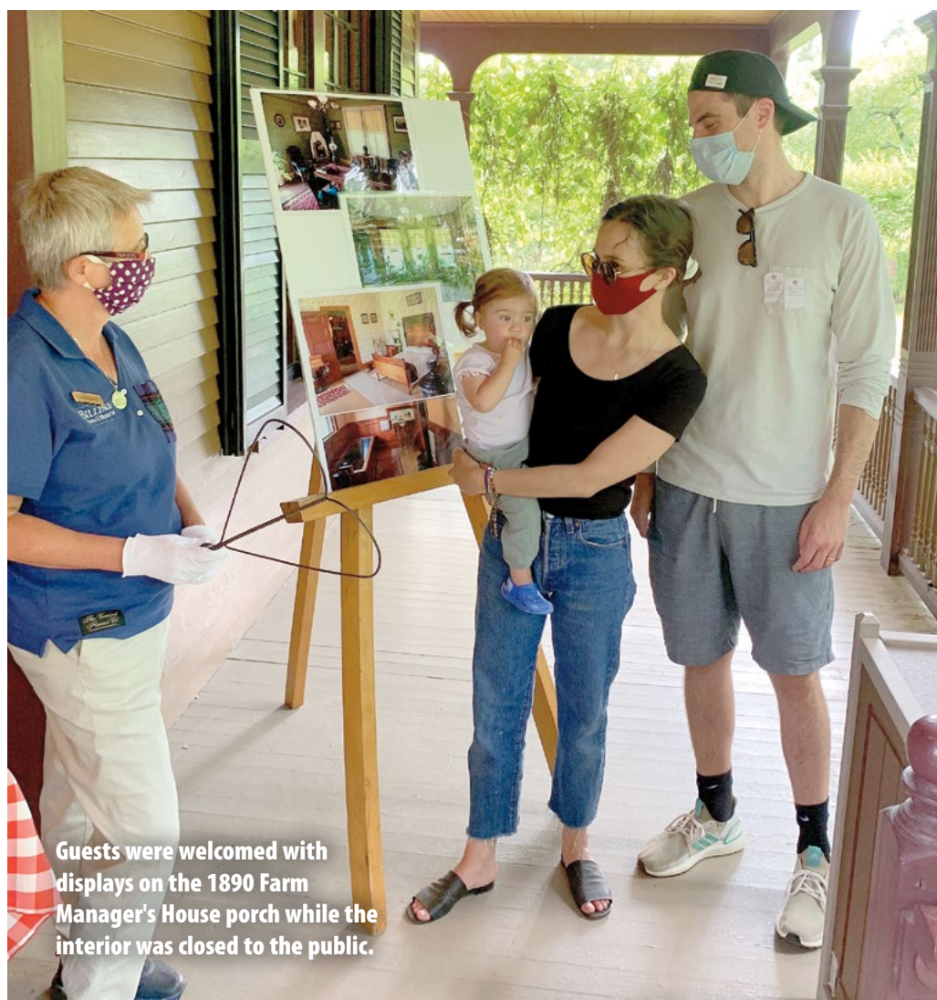
Guests were welcomed with displays on the 1890 Farm Manager's House porch while the interior was closed to the public.