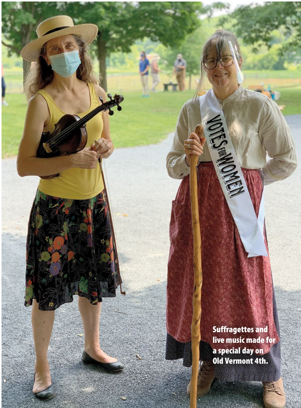
Suffragettes and live music made for a special day on Old Vermont 4th.