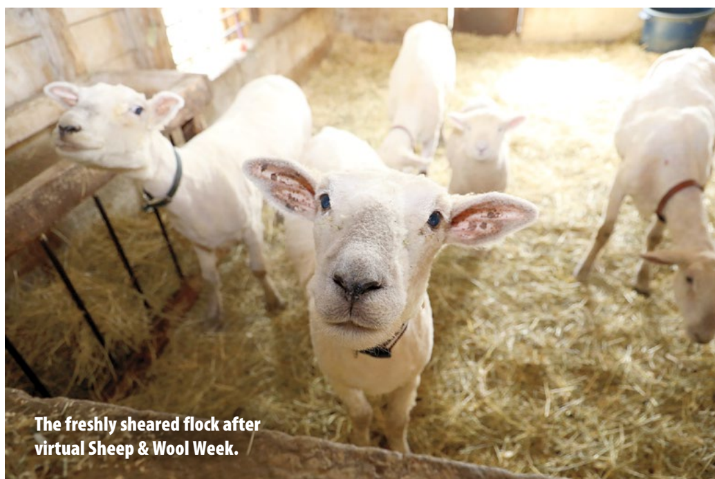
The freshly sheared flock after virtual Sheep & Wool Week.