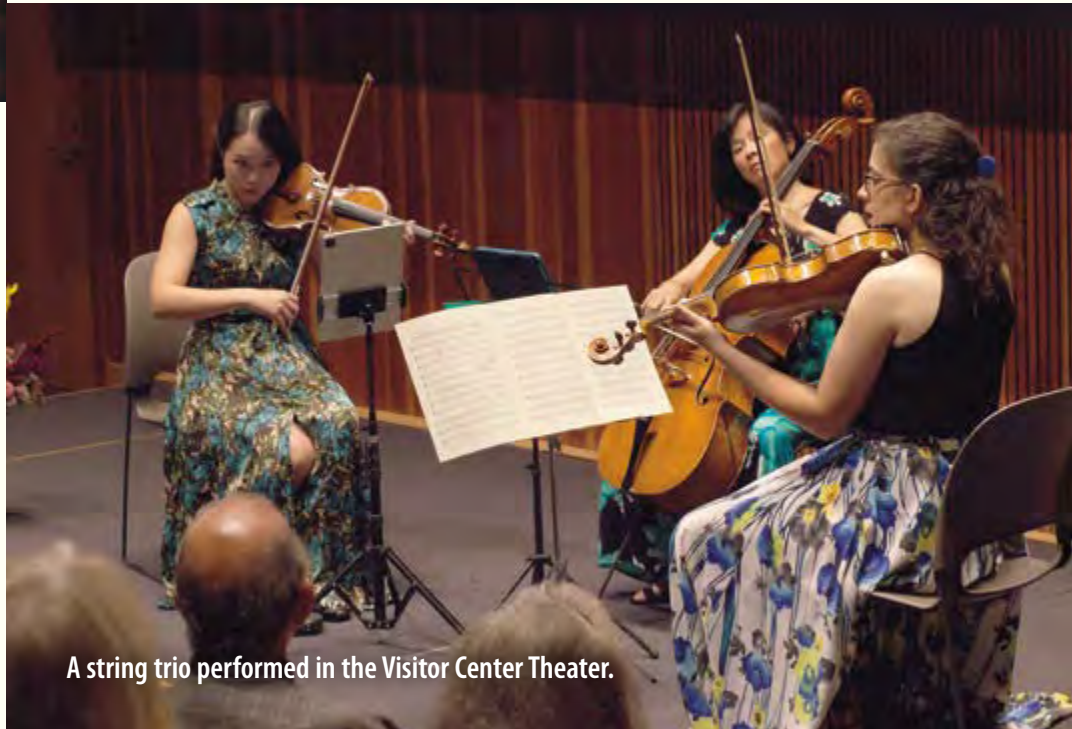
A string trio performed in the Visitor Center Theater.

The Woodstock Inn & Resort and Billings Farm teamed up in numerous ways to educate the public. In addition to designing and building the Farmstead Gardens together with the Resort, Billings Farm featured the creative talent of the Inn's Master Gardener, Ben Pauly, in a sold-out Billings Backyard Workshop: Natural Holiday Decorations . The two organizations also collaborated on a video highlighting the story behind Billings Farm cheeses and showcasing their use as the key ingredient in the Woodstock Inn's celebrated fondue.