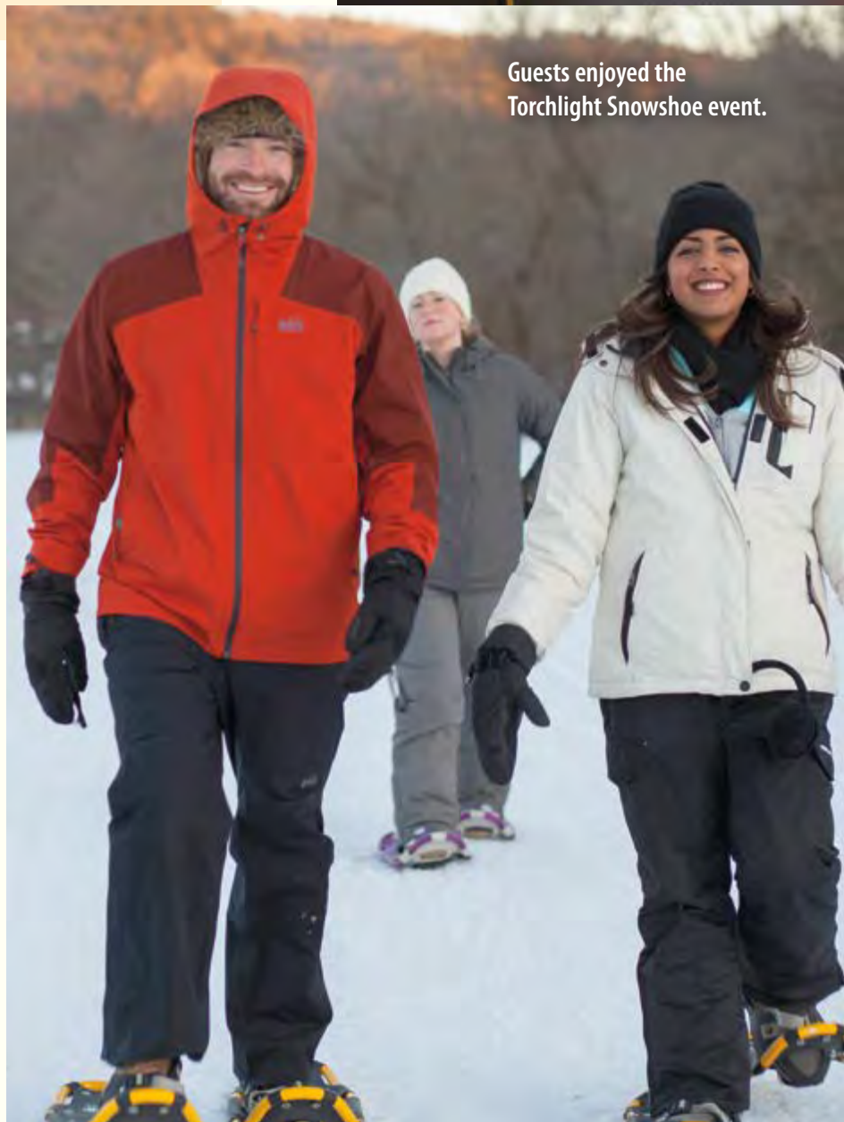
Guests enjoyed the Torchlight Snowshoe event.