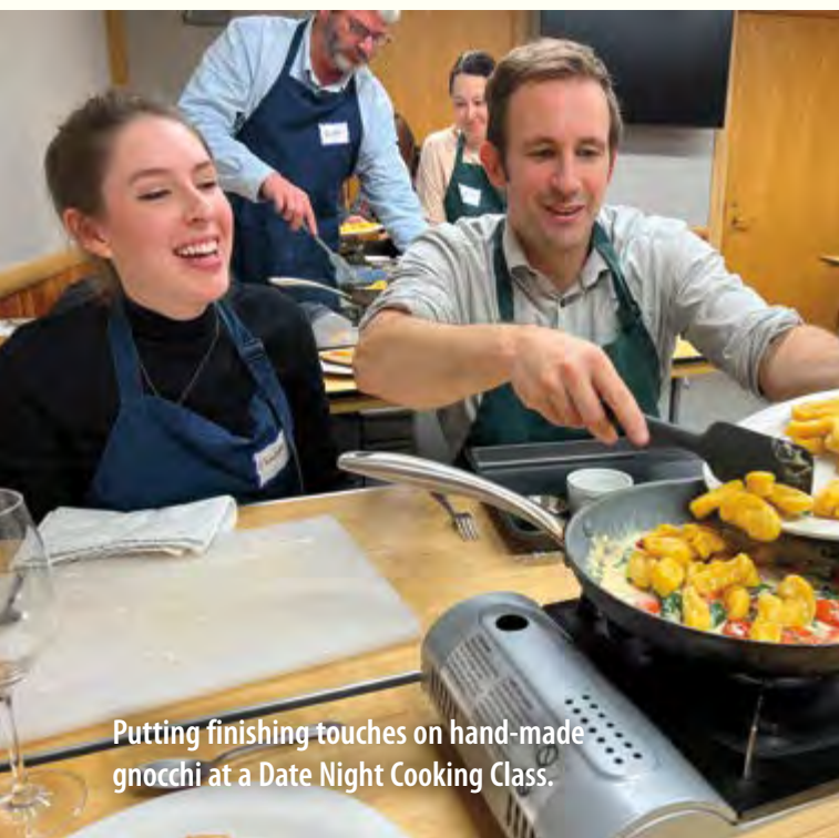
Putting finishing touches on hand-made gnocchi at a Date Night Cooking Class.