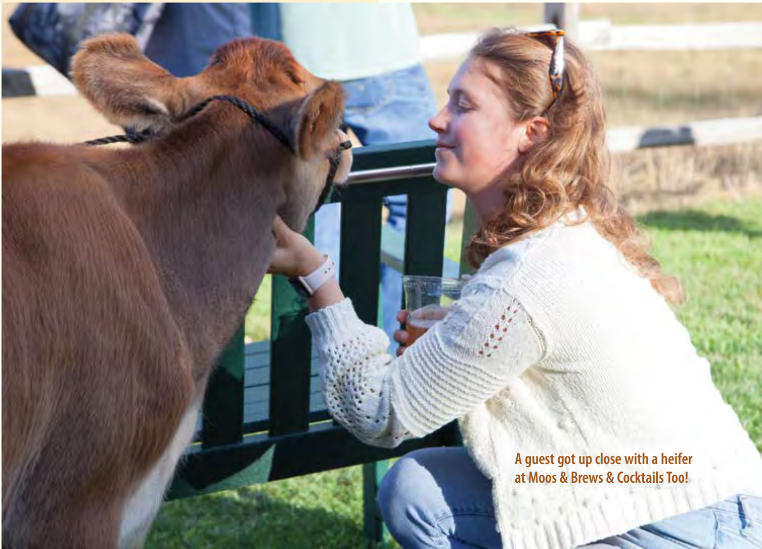
A guest got up close with a heifer at Moos & Brews & Cocktails Too!

Moos & Brews & Cocktails Too! featured local breweries and distilleries along with opportunities to meet our cows and our farmers. Over the course of two evenings, nearly 500 guests sipped adult beverages, chatted with Billings Farm educators, listened to live music, and enjoyed the early evening beauty of the farm.