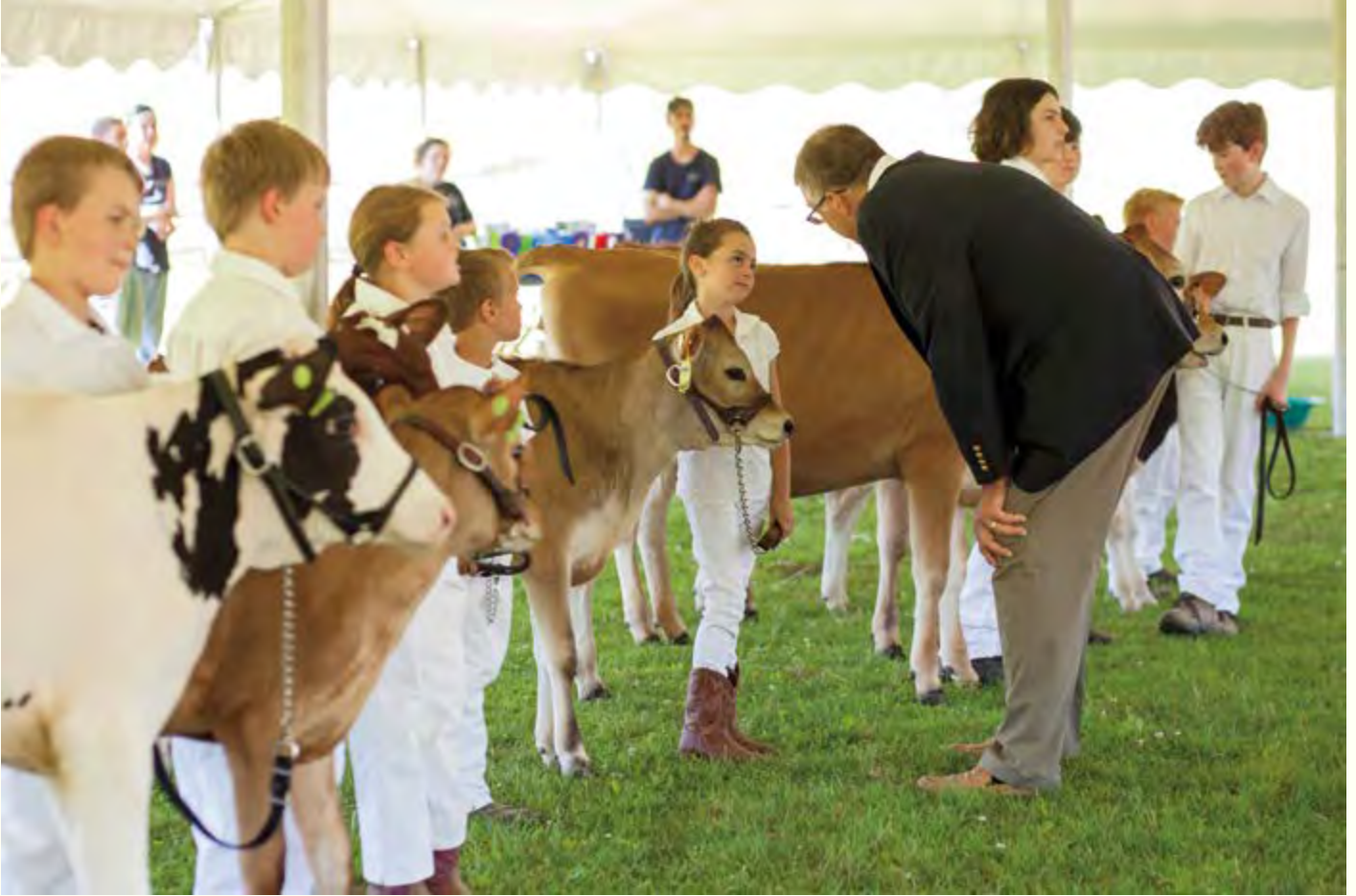
ABOVE: A young 4-H member responded to the judge's questions during the Youth Invitational Dairy Show. LEFT: Junior Farmer campers enjoyed meeting the chickens.

In line with Frederick Billings' vision to create a farm where other farmers could come to learn, the annual Youth Invitational Dairy Show provided prospective farmers with the chance to hone their skills and knowledge. The Dairy Show roared back to life in 2022 with a record 19 participants ages 5–17. In addition to supporting a learning environment where young farmers could show their animals and engage with the public, this year's show offered scholarship awards to support participants' pursuit of farming and animal care.